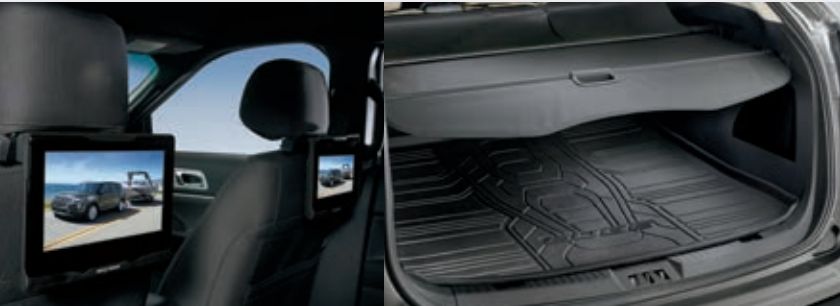
Rear Seat Entertainment System 1 Interior cargo cover and cargo area protector