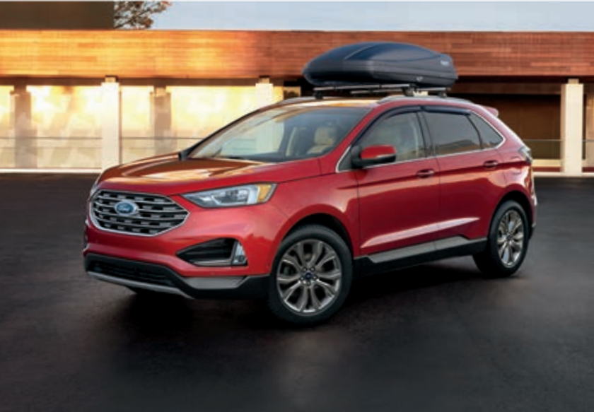
Titanium in Rapid Red Metallic Tinted Clearcoat accessorized with smoked side window deflectors, 1 front and rear molded splash guards, roof-mounted crossbars and cargo box, 1,2 and wheel lock kit