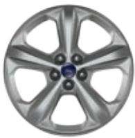
18" SPARKLE SILVER-PAINTED ALUMINUM Standard

2.0L ECOBOOST® WITH AUTO START-STOP TECHNOLOGY 8-SPEED AUTOMATIC TRANSMISSION