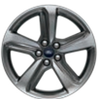
18" BRIGHT-MACHINED ALUMINUM WITH PREMIUM DARK STAINLESS-PAINTED POCKETS Optional