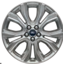
19" LUSTER NICKEL-PAINTED ALUMINUM Standard