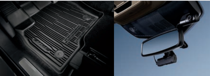
Floor liners Dash cam systems 1

SHOP THE COMPLETE COLLECTION | accessories.ford.com