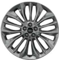
20" POLISHED ALUMINUM Standard

COLORS: Desert Gold; 2 Iconic Silver; 2 Magnetic; 2 Agate Black; 2 Burgundy Velvet Metallic Tinted Clearcoat; 3 Star White Metallic Tri-coat 3