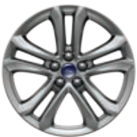
18" SPLIT-SPOKE SPARKLE SILVER-PAINTED ALUMINUM Standard

OPTIONS Cargo Accessories Package: interior cargo cover, cargo area protector, and rear bumper protector Class II Trailer Tow Prep Package with Trailer Sway Control (requires AWD) Cold Weather Package: heated steering wheel, windshield wiper de-icer, and front and rear floor liners Convenience Package: perimeter alarm; Remote Start System; 110V/150W AC power outlet; universal garage door opener; wireless charging pad; and hands-free, foot-activated liftgate Ford Co-Pilot360 Assist+: Adaptive Cruise Control with Stop-and-Go and Lane Centering; Evasive Steering Assist; and Voice-Activated Touchscreen Navigation System with pinch-to-zoom capability (includes SiriusXM® Traffic and Travel Link® with 5-year subscription 1 ) All-wheel drive (AWD; includes AWD disconnect) Cargo net Dual-Headrest Rear Seat Entertainment System 4,5 Engine block heater Front and rear floor liners Power, panoramic Vista Roof® 5 Wheel-locking lug nuts