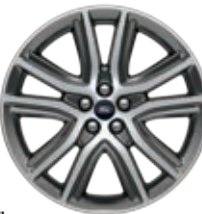
20" BRIGHT-MACHINED ALUMINUM WITH PREMIUM DARK STAINLESS-PAINTED POCKETS Optional