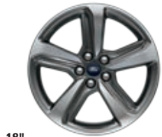
18" BRIGHT-MACHINED ALUMINUM WITH PREMIUM DARK STAINLESS-PAINTED POCKETS 3 Optional; includes snow chain-compatible tires